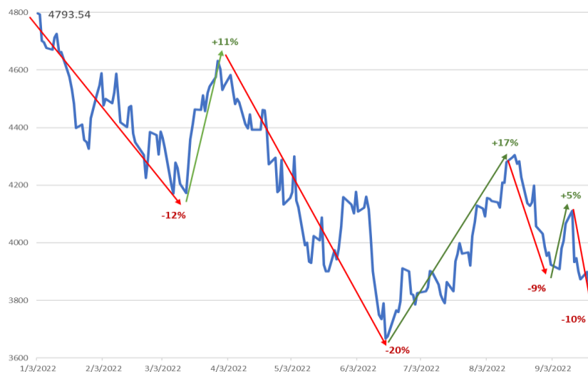
S&P 500 Index – 2022 Performance

Data as of 1/3/2022-9/23/2022